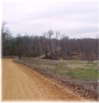
Rural Road found in St. Francis County South of Madison, AR

to, on bad weather days. This point was brought out at the Delta Compact Summit meeting recently held in Clarksdale, Mississippi. We have had more snow days on record, or ice days in the last twenty years than anybody can recall. Yes, there was a big freeze and the Mississippi did freeze up, but not for the long duration that we are now experiencing.