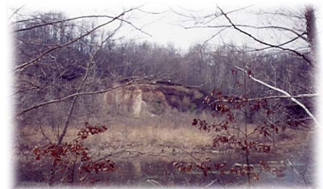
The Old Military Road that goes through the St. Francis National Forrest in Phillips County