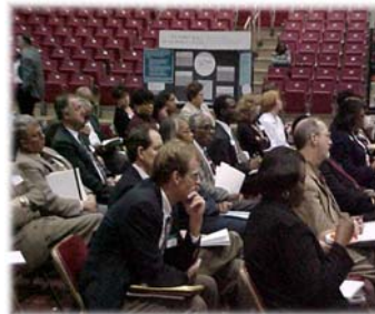
Delta Compact Summit meeting, March 14, 2000 Coahoma Community College Clarksdale, Mississippi

what the Delta Compact stands for, and it wasn't surprising when cooperation became another central theme in this meeting. We all know the Delta Compact was built on the cooperation/partnership concept, but I think that people are now starting to get more of an idea of what that really means. They are starting to try and jell themselves together with a com-