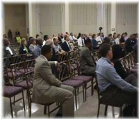
Delta Listening Session, Baton Rouge, LA October 1999