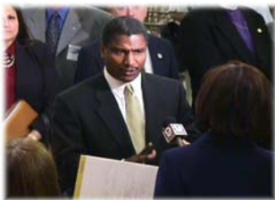
Rodney Slater, U.S. Secretary of Transportation speaks with a Reporter in Baton Rouge, LA