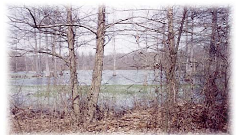
The Old Military Road that goes through the St. Francis National Forrest in Lee County