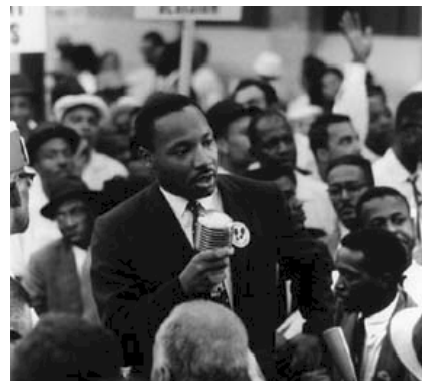
Leading a demonstration demanding a strong civil rights plank in the GOP campaign platform, in Chicago.