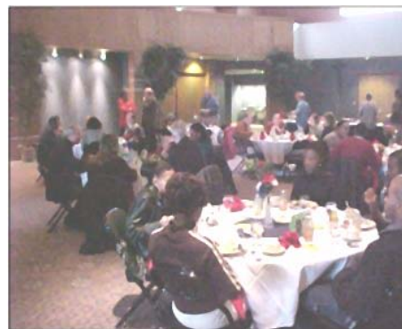
Martin Luther King Jr. Brunch Attendance