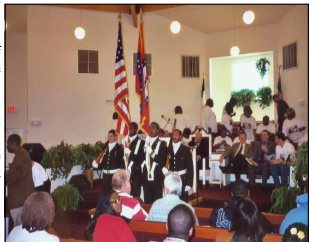
St. Johns Baptist Church, Jonesboro, Arkansas. Marchers attended an inspirational program that commemorated Dr. Martin Luther King Jr. day.

be educated, and finally to give themselves a voice in the development of their own government, by registering to vote.