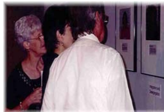
Guests looking at the Oral History Exhibit.